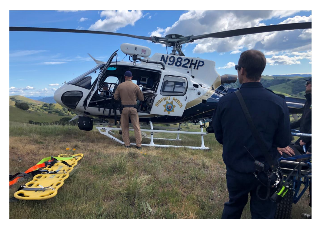
On March 5, 2022, E58 responded to a hiker down on Big Rock Ranch Fire Road. This was a mutual aid call involving Marin County Fire Department and the Skywalker Ranch Fire Department. The California Highway patrol provided assistance in getting the hiker to care via airborne transport to a waiting ambulance. The patient was elderly and had injured her ankle in a fall.