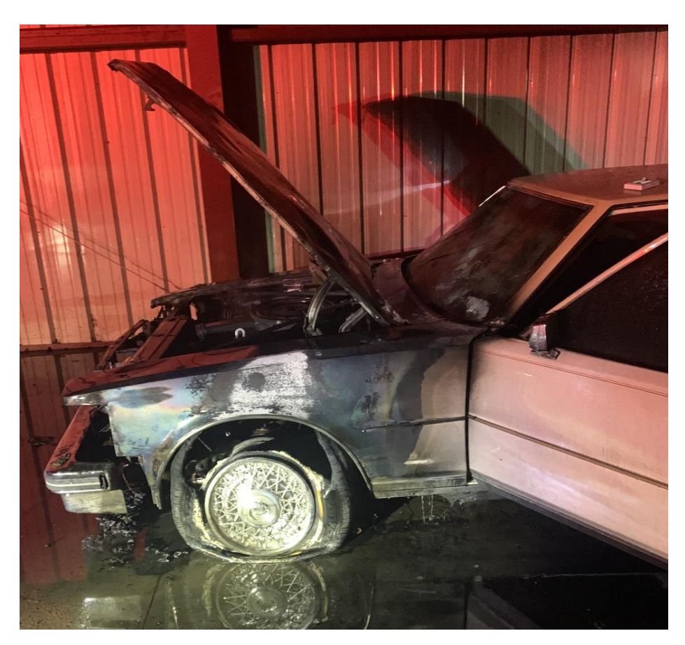
On March 31, 2022, E58 and a full first alarm assignment was dispatched to 400 Smith Ranch Rd. at approximately 8 p.m. (The San Rafael airport). There was a vehicle in one of the hangers that was having repair work performed when the engine compartment caught fire. Engine 58 quickly knocked it down. There was no damage to the hanger or the structure.